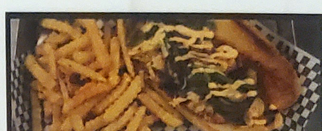
★ Cajun Chicken Philly

Oven baked ciabatta with bacon, ham, pepperoni and topped with a melted cheese blend and lettuce, tomato, onion, house balsamic and garlic mayo. 16