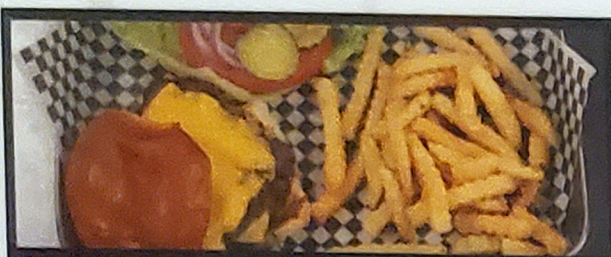
Brake's Burger (don't let the name fool you)

Premium side: crab rangoons, toasted ravioli, mac n cheese bites or mozzarella sticks. +4