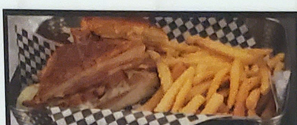
★ Italian Stallion

Classic smash burger with American cheese and a toasted bun. single 14 / double 16